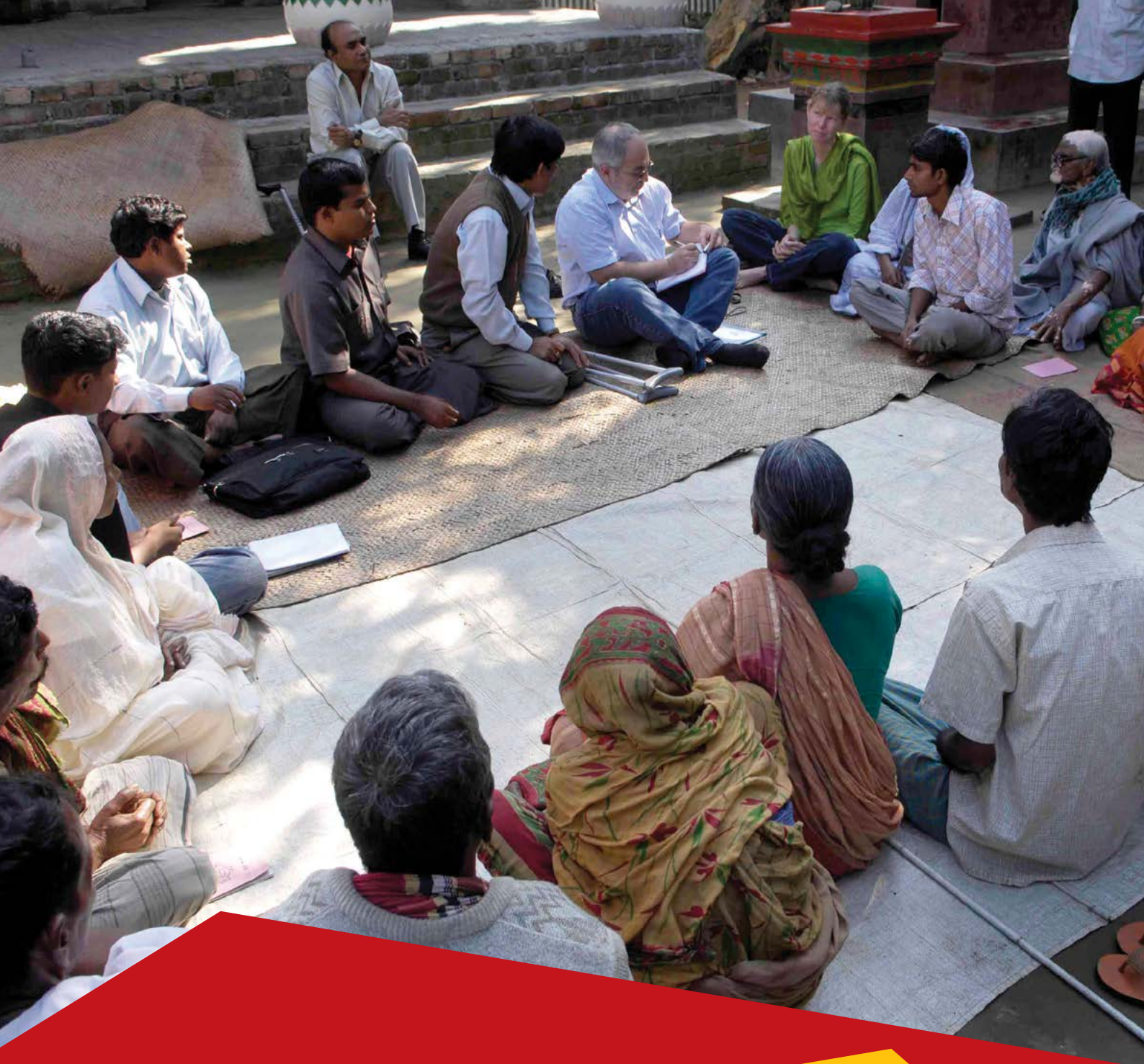
A group sits together having a discussion (© CBM/Grossmann).