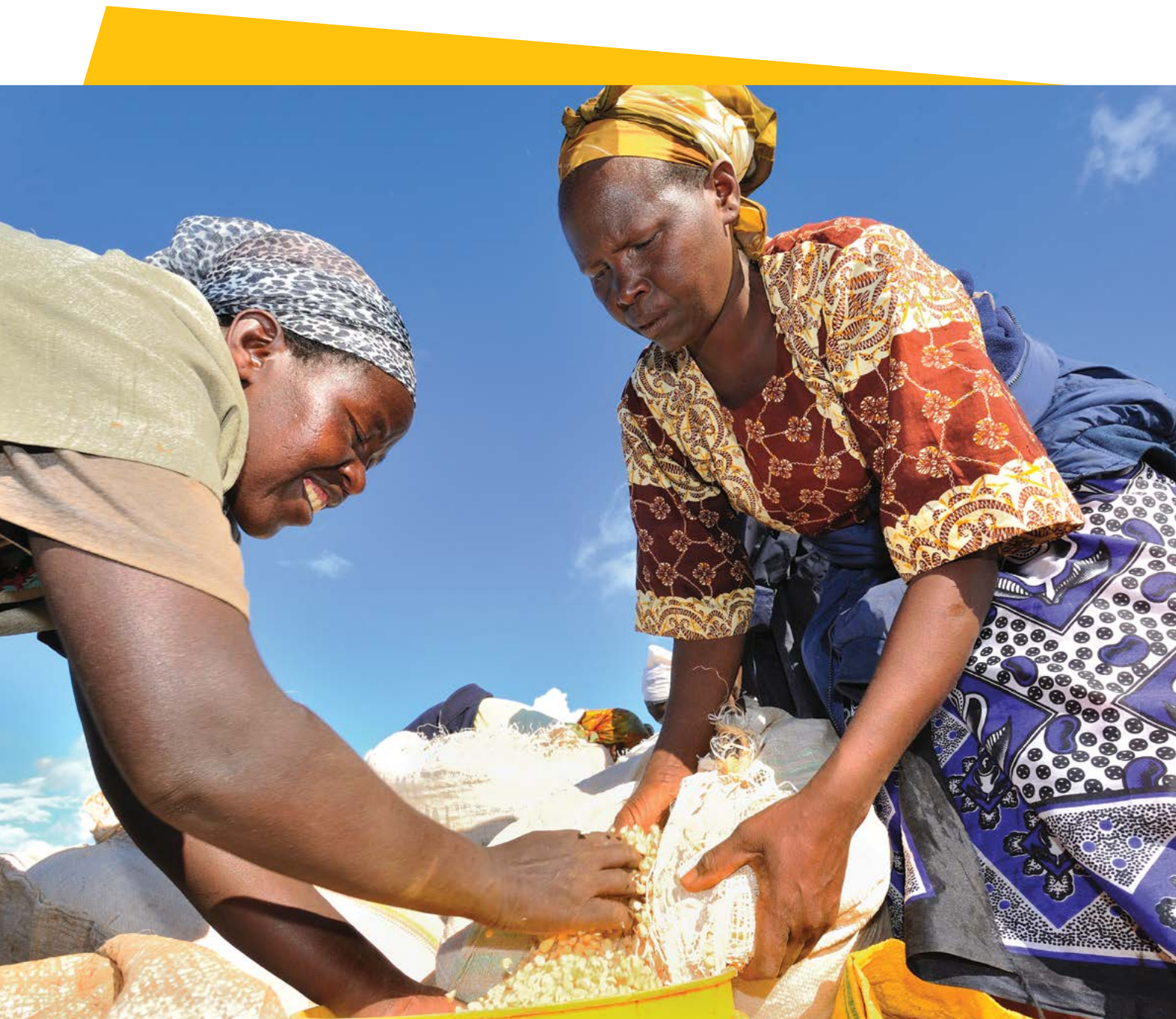
Food distribution in Kenya.