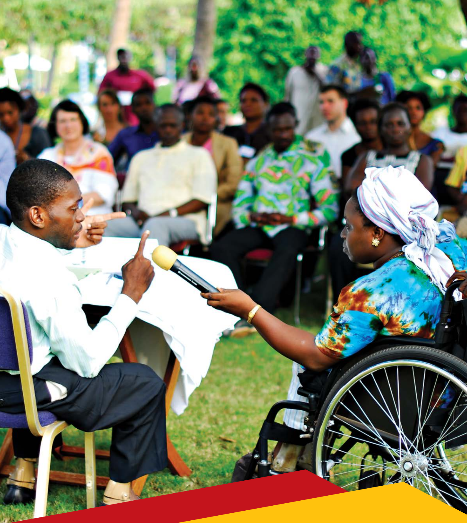
Members of the theatrical group 'Tibi' rehearse a short sketch - Togo.