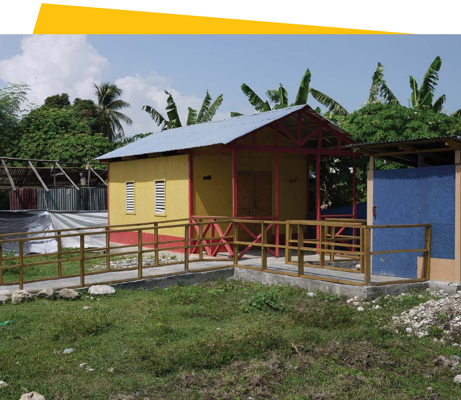
Haiti after the earthquake from January 2010: Accessible shelter.